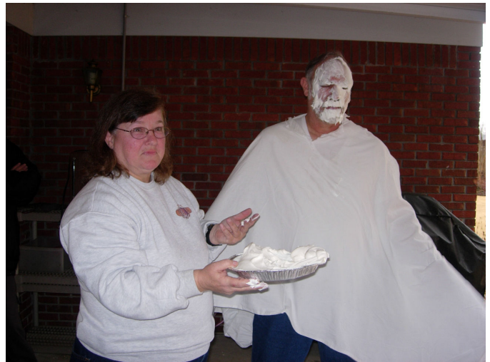
"Okay folks, now do you see how it is done?"