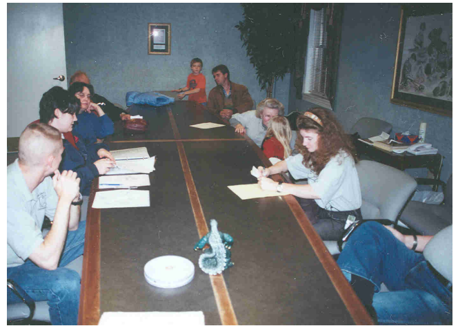
Some of the crew at our December Membership Meeting (16 December 2004)