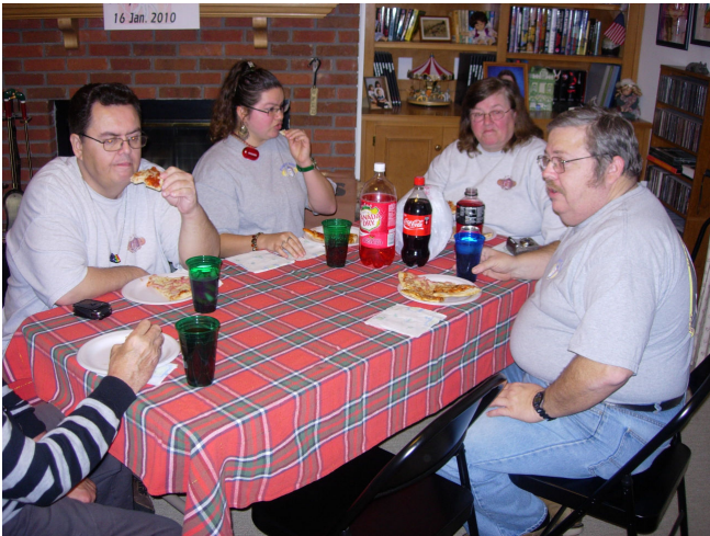
USS Robins members enjoying the pizza.

devoured the pizza and were anxious for the pie ceremony but first there were door prizes and awards to give out.