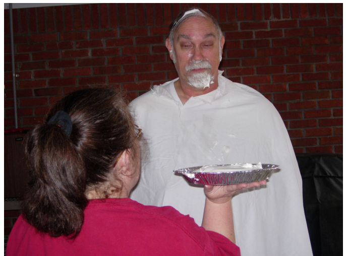
"Honey, I thought you loved me?"