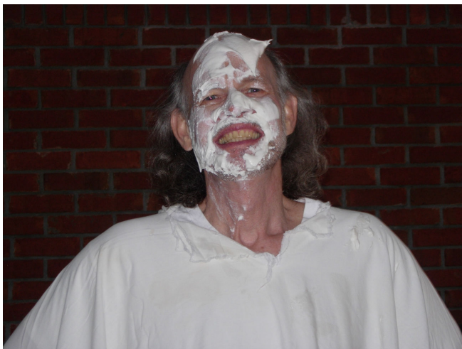
And just why is this man smiling?