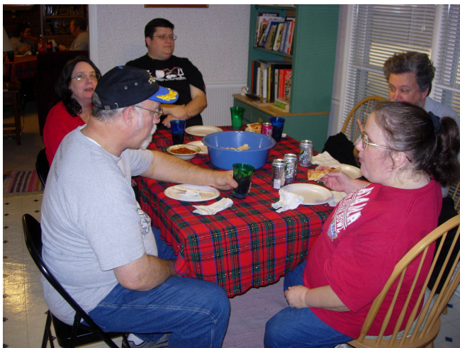
DaVinci members at the party.