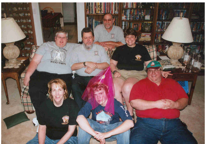
DaVinci crew and guests from the USS Atlanta and USS New Hope!