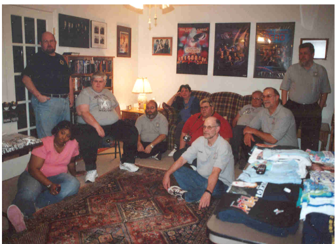
Watching Trek in the TV room!