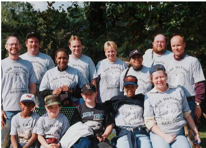
The DaVinci crew at our first Help-the-Hooch River clean up (18 October 1997)

The annual Help the Hooch River clean up will be held on 16 October! This will be the 14 th consecutive year that the DaVinci will participate in this worthwhile event! I really would like to see at least one crewmember for each year, so mark your calendars for this event. We will meet at Rigdon Park (off South Lumpkin Road) at 8:30 AM. Following the clean up we will adjourn to Golden Park where there will be a thank-you party for all the Help-the-Hooch volunteers. There will be free hotdogs, chips, and drinks available to all. In addition there will be games, activities, and displays. Come one, come all and help the Hooch! Hey, check out the photo below from our first clean up way back in 1997! Just who are those young folks! Is your picture there?