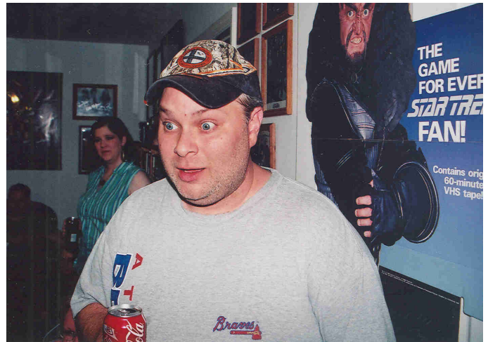
“Hey! She has hardly any clothes on!”