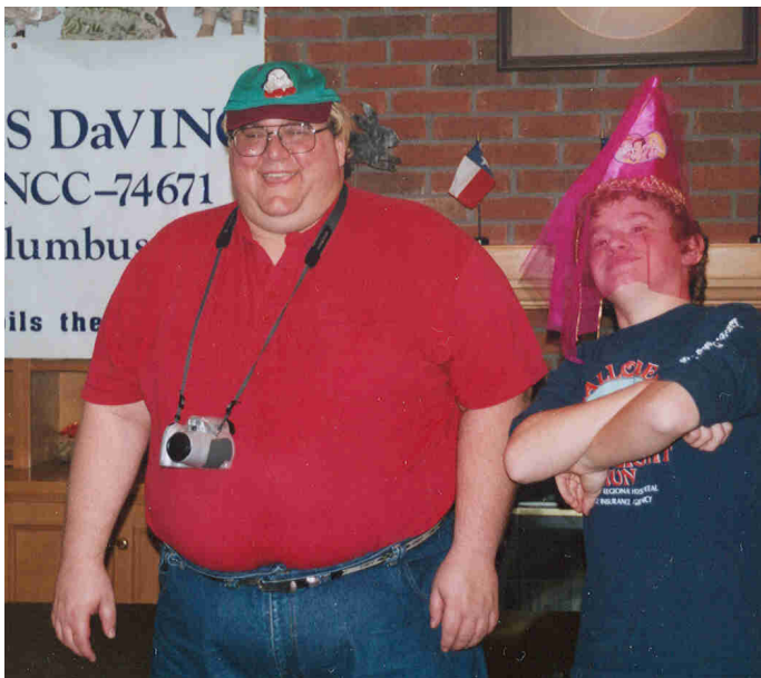
Another pose from the Lesser Peon and Great Dalmuti!