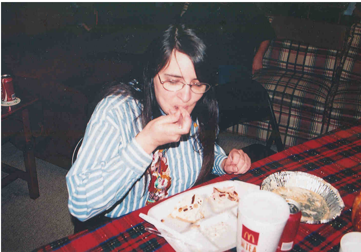
“Mummm, peanut butter pie!”