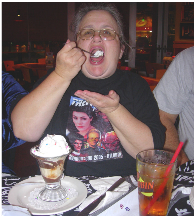
“Mummm, ice cream and free too!”