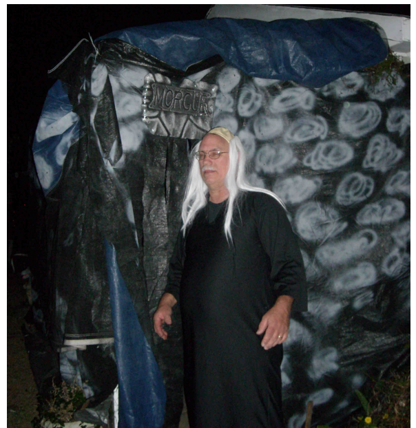
I always knew I would find my true calling!

Who knows what evil works in the hearts of the "DaVinci West" for next year? Only time will tell. Ha, ha, ha, ha, ha!!!!