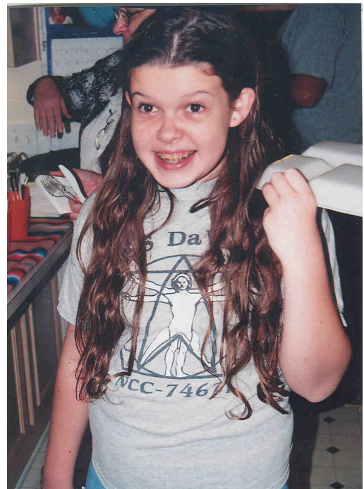
"Oh boy, it is my turn!"