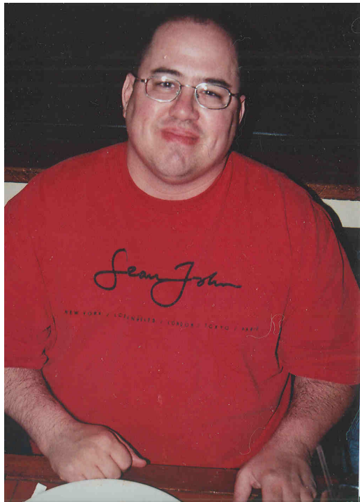
The guest of honor!