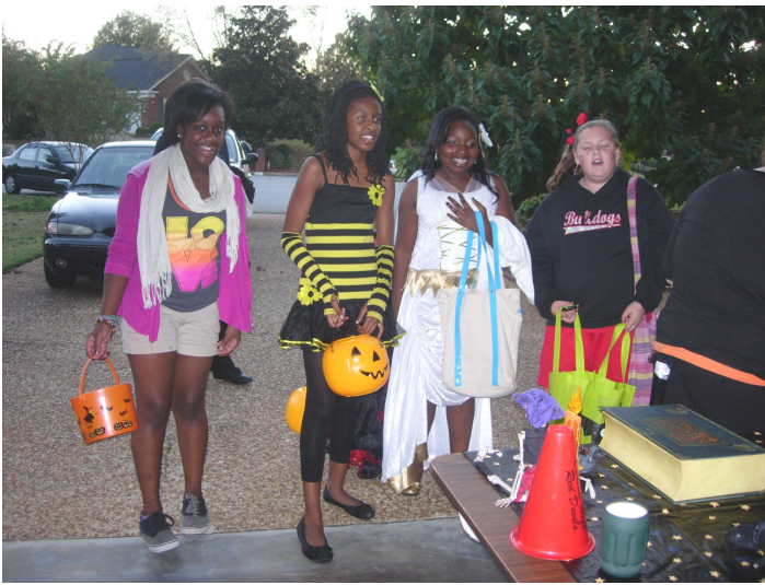
And arrive they did!