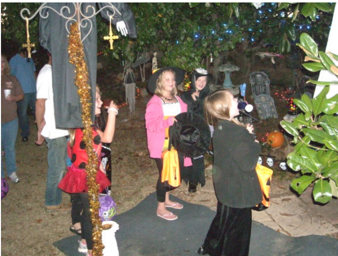
One of the donut eaters tries for a prize while others wait their turn.