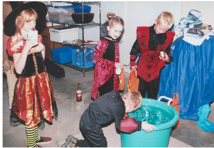
Having fun at the bobbing for apples station!