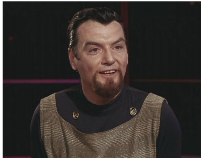
Cambell as CPT Koloth in the TOS Episode “The Trouble with Tribbles”

Campbell had supporting roles in several classic films, including Operation Pacific (1951), Escape from Fort Bravo (1953), The High and the Mighty (1954), Battle Cry (1955), The Naked and the Dead (1958), and Hush... Hush, Sweet Charlotte (1964). He also co-starred in Elvis Presley’s first feature, 1955’s Love Me Tender, becoming the first actor to ever sing with Presley in a motion picture. One of his few leading roles was in the Roger Corman-produced 1963 cult horror-thriller Dementia 13, which was the first film directed by Francis Ford Coppola.