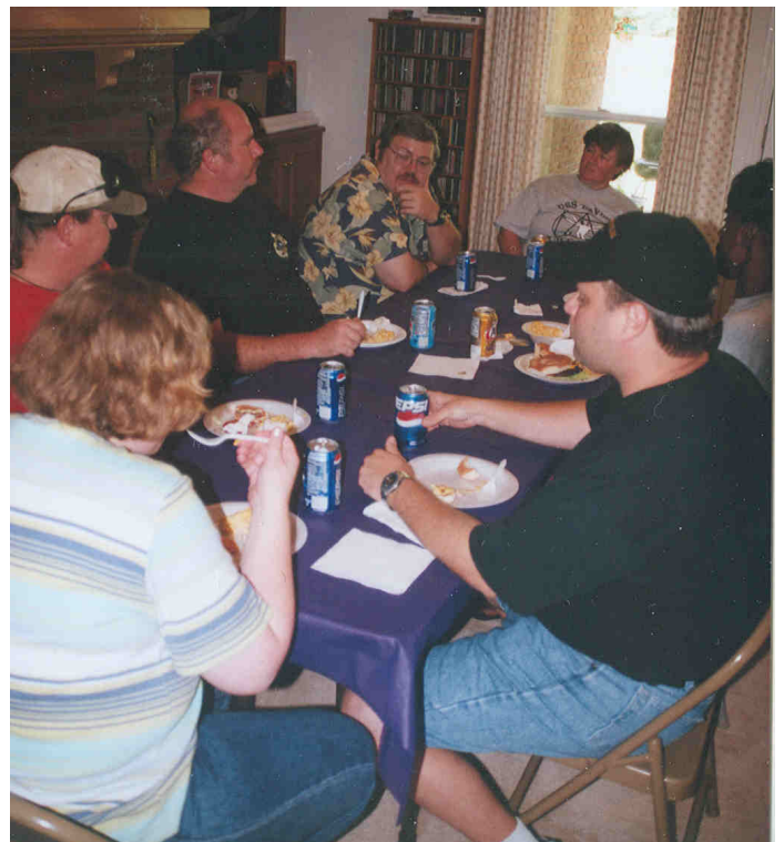
The crew chatting Trek over a good meal!