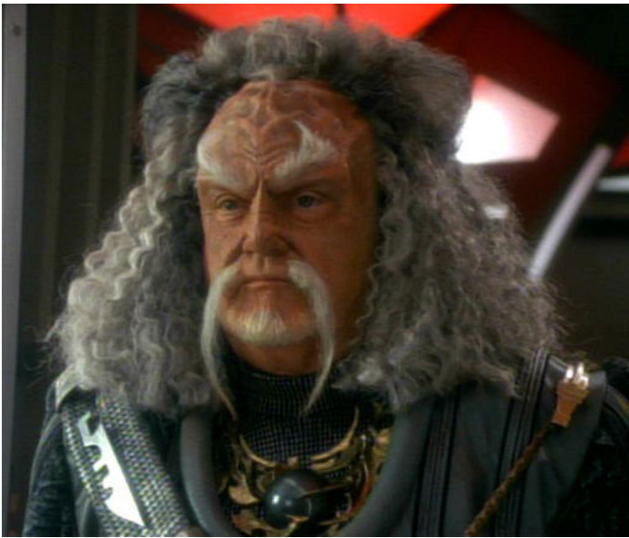
Campbell as Koloth in the Deep Space Nine Episode “Blood Oath”

Star Trek was not the last time Campbell worked with series creator Gene Roddenberry; one of his last features was the 1971 caper comedy Pretty Maids All in a Row , which Roddenberry wrote and produced. This film also reunited Campbell with TOS regular James Doohan.