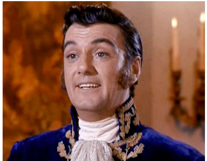
Campbell as Trelane in the TOS Episode “The Squire of Gothos”

Campbell also played Koloth in the video game Star Trek: Judgment Rites, but, unlike Colicos’ Kor and Ansara’s Kang, he did not appear in any subsequent Star Trek episodes.