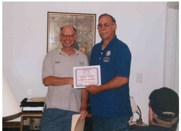
Surprise! You too Number One!