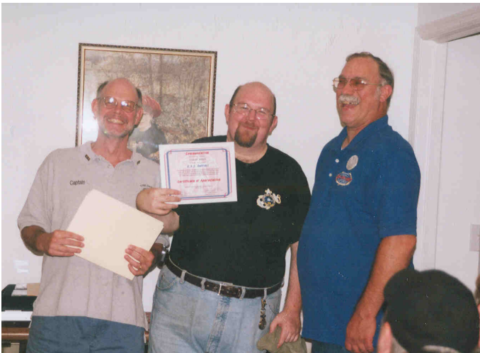
Yep! Frazier too!